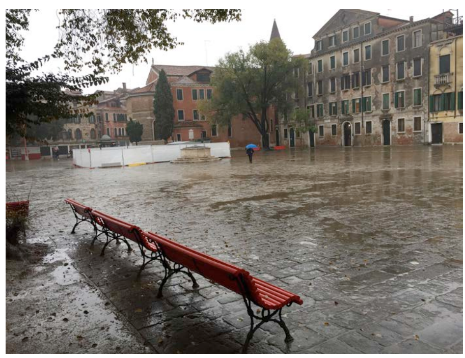
Campo San Polo