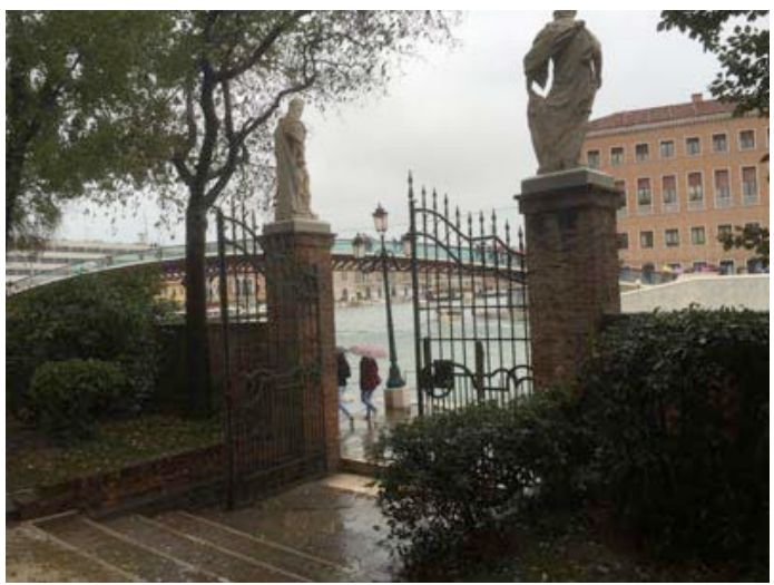
From Garden to Fondamenta della Croce