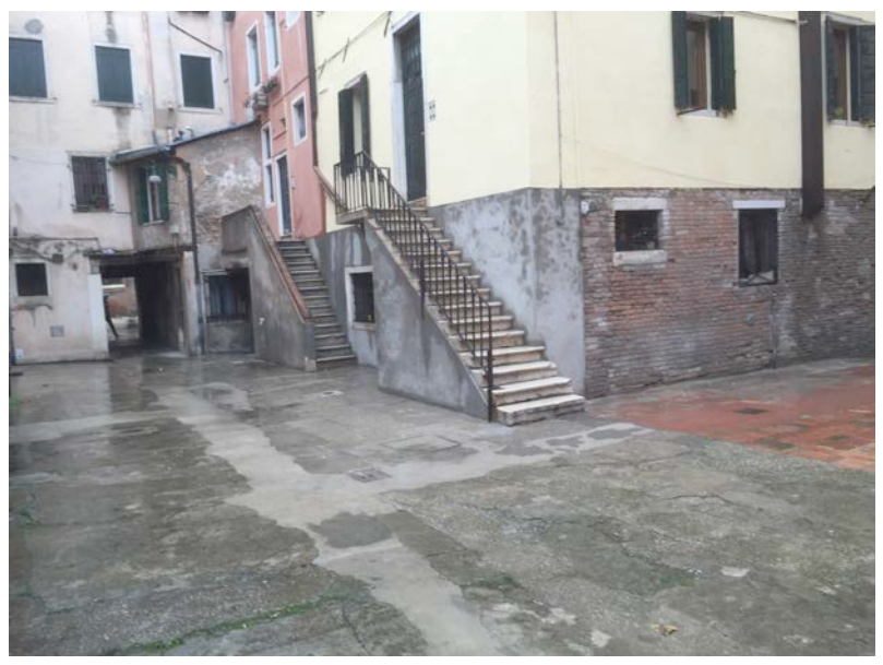
Corte delle Scale