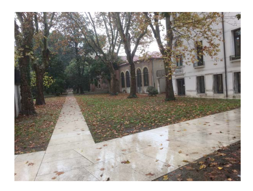
Interior of the Ca'Foscari's university

Continue in the same direction under a gallery. On your left hand, you will see the Ca'Foscari University, for architects.