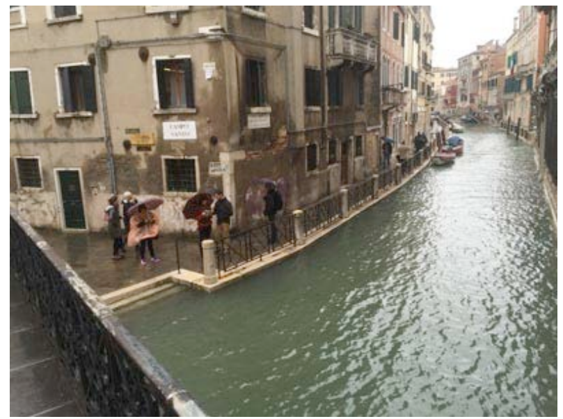
Ponte to Fondamenta Rio Marin o Garzotti

Go over the bridge, turn right and arrive at Calle dell'Ogio o Del Cafetier.