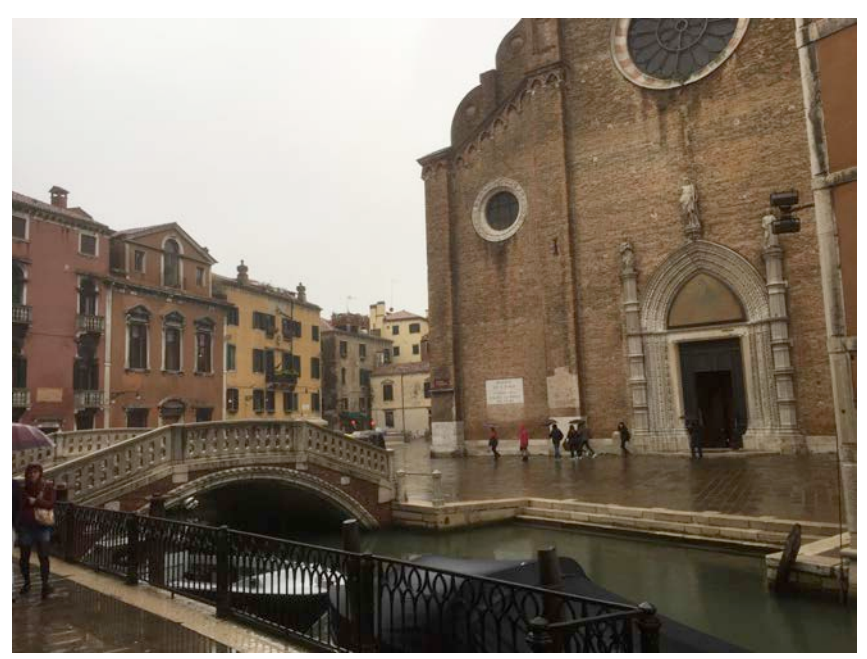
Chiesa dei Frari

After San Marco church, the Frari is the most important church of Venice. Lot of beauty and history.