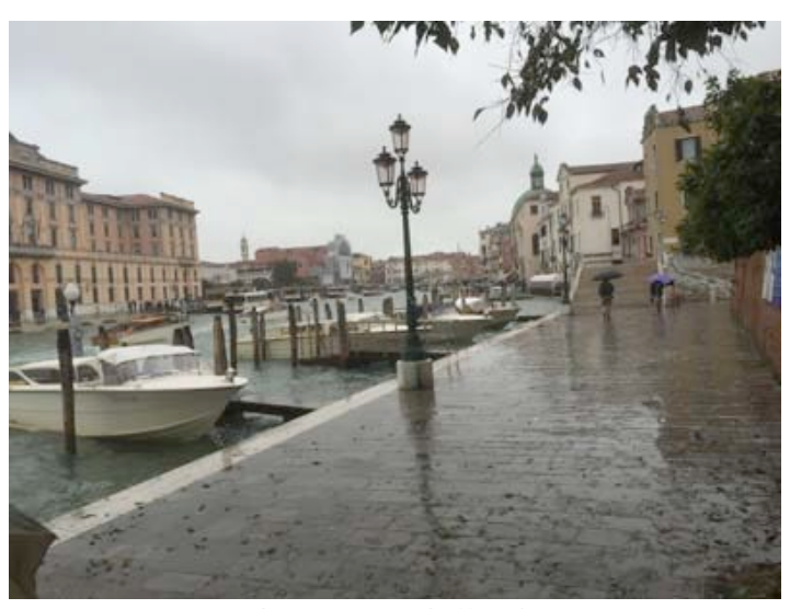
Fondamenta della Croce

Then go to Ponte dei Scalzi, which is in front of the railway station Santa Lucia, and turn right to Calle Lunga Chioverette, then turn left to Calle Bergamin.