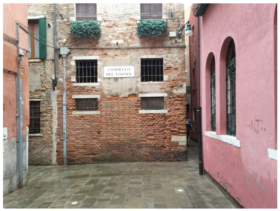
Campiello del Forner

Take the path right on, then forwards to the Calle di Cristo, and Ponte San Bernardo.