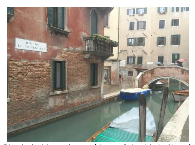
Rio de le Muneghette (river of the Little Nuns)