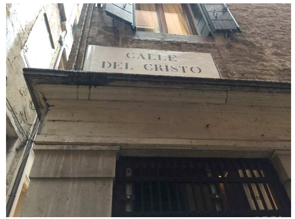
Calle di Cristo