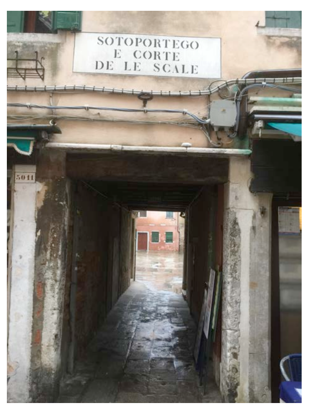
Take this arcade to the charming place of Court of Stairs