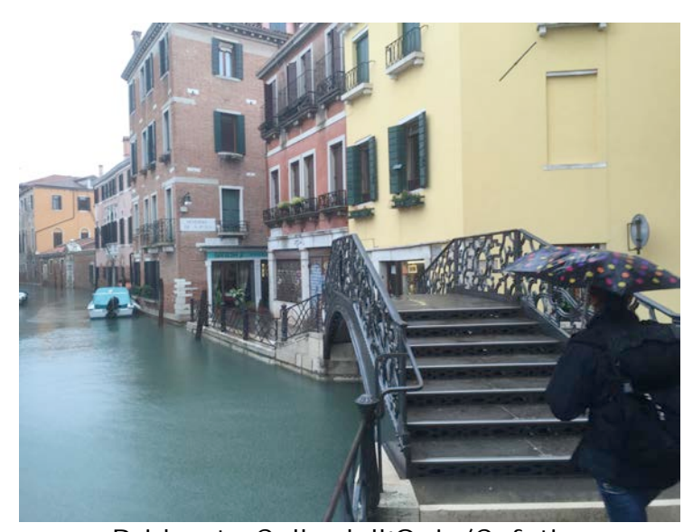
Bridge to Calle dell'Ogio/Cafetier

Go over the bridge, turn right and arrive at Calle dell'Ogio o Del Cafetier.