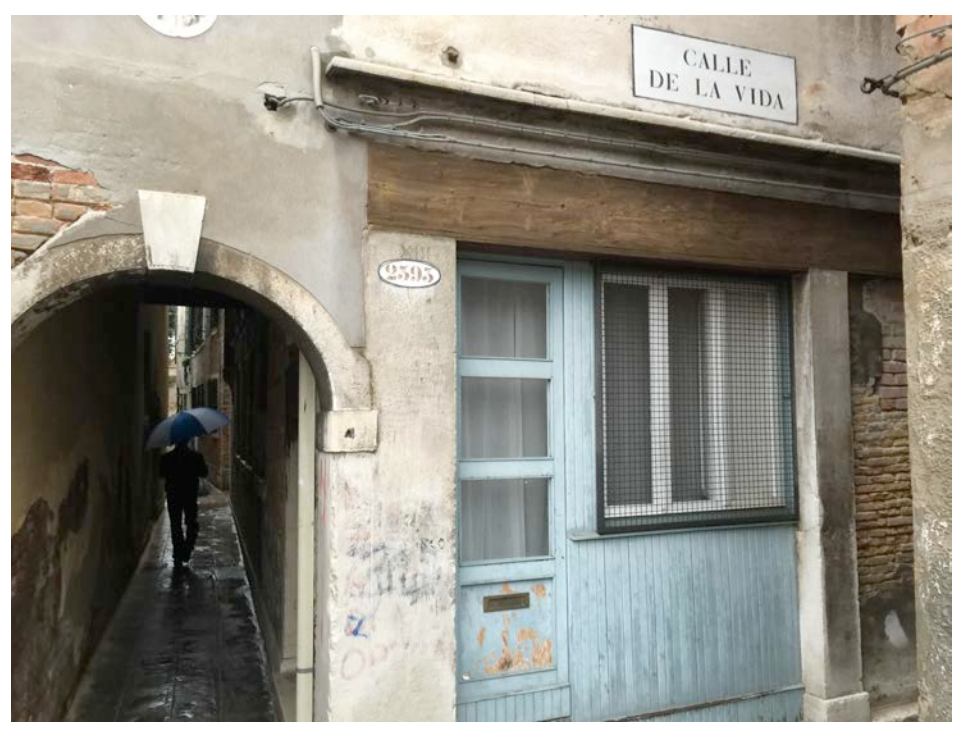
Take the Calle de la Vida