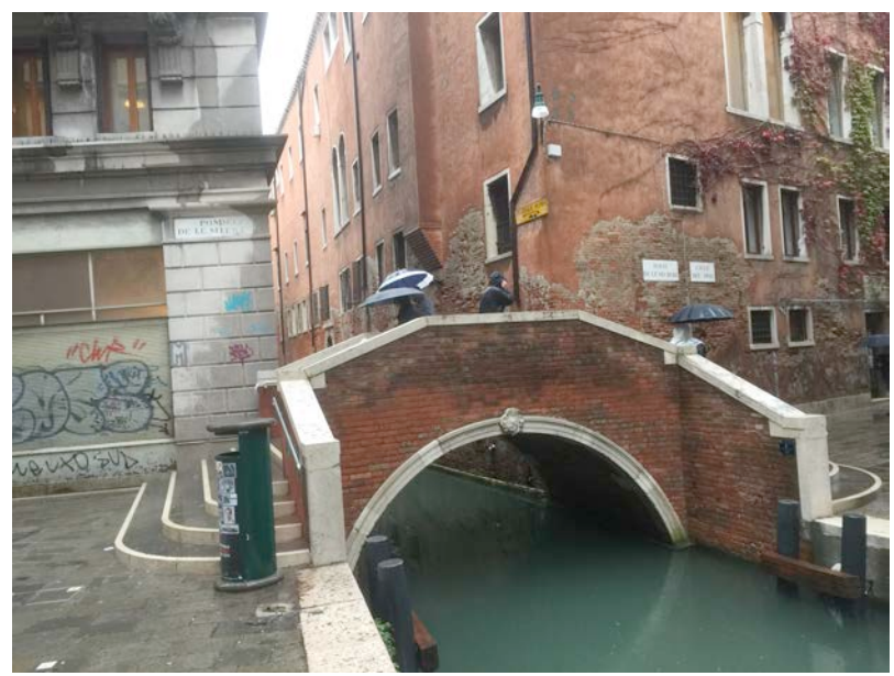
Continue up to this bridge, that leads to Calle dei Amai = Path of the Beloved Then, return to the Campiello San Giovanni and Calle dell'Ogio.