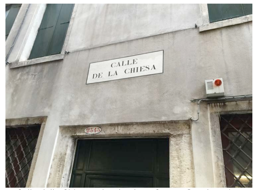
Calle della Chiesa, that leads to Campo San Agostino