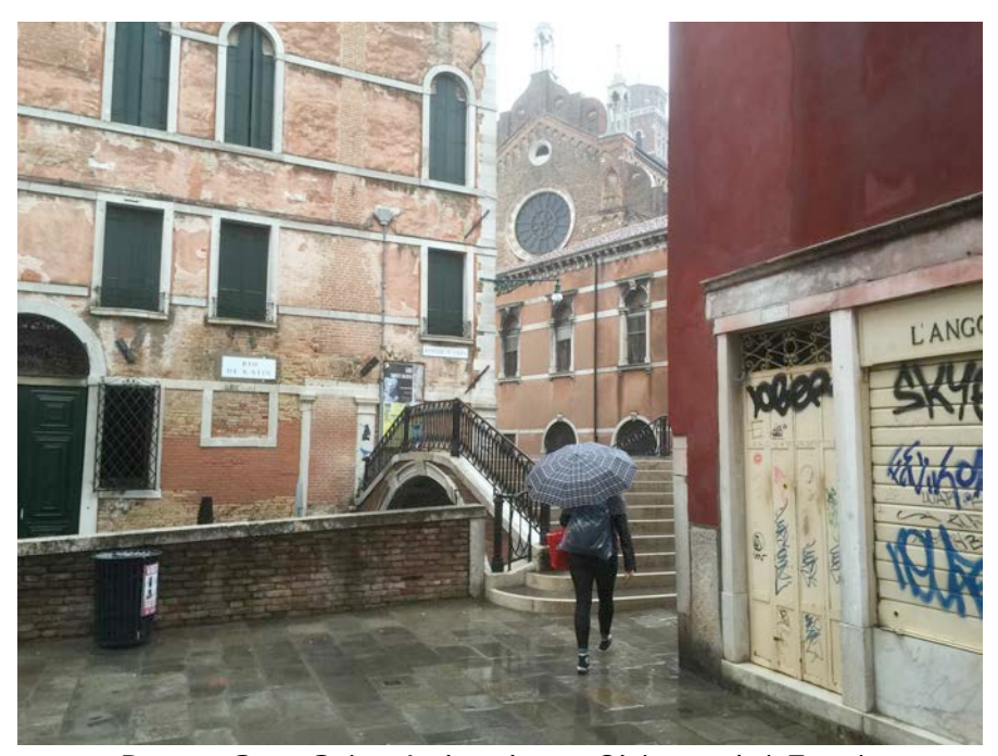
Ponte San Stin. It leads to Chiesa dei Frari.