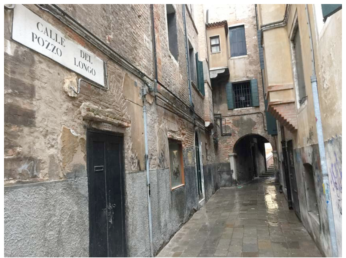
Calle del Pozzo Longo, that leads to Calle della Chiesa, after the bridge.