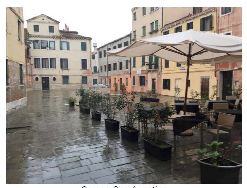
Campo San Agostino

After Campo San Agostino, the streets here become more and more narrow. Here it feels the demographic density of the ancient Venice.