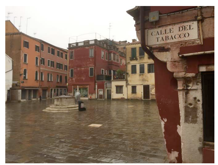
Campo San Vito

Go back and find Campo San Vito. Very lovely.