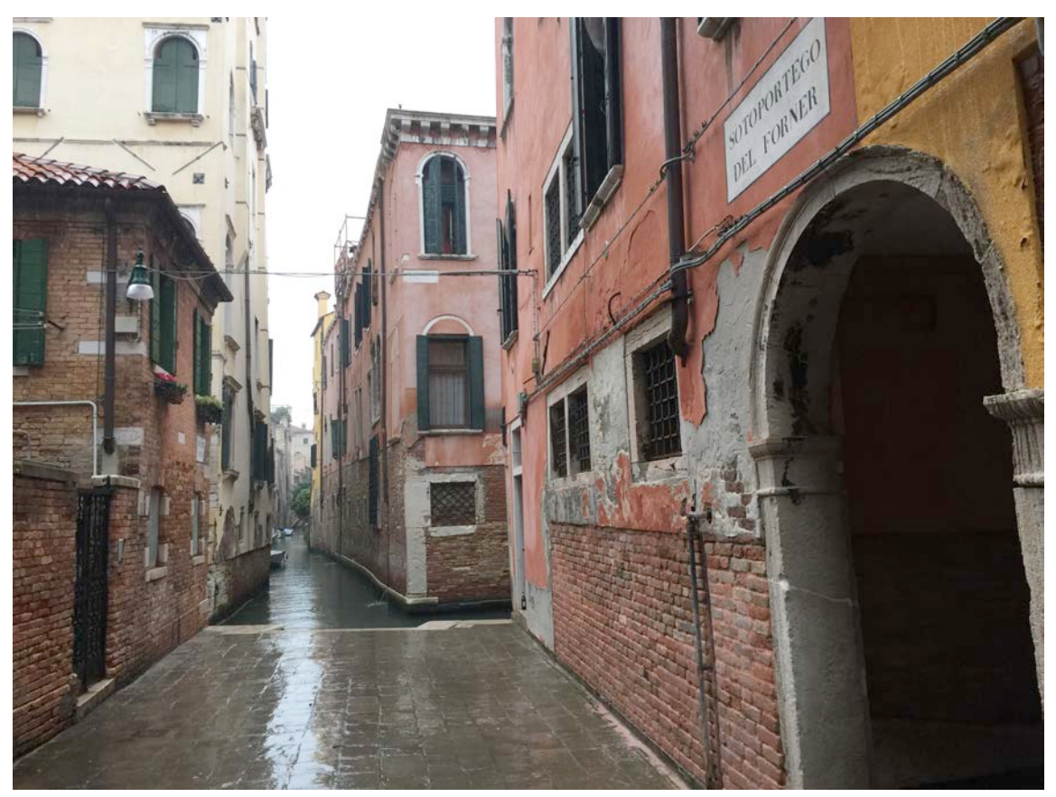
Rio Terà Secondo to Rio San Boldo, take the porch of Sotoportego del Forner