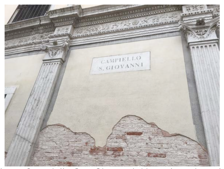
200 meters, turn right to Campiello San Giovanni. Very charming, the church, etc. etc.