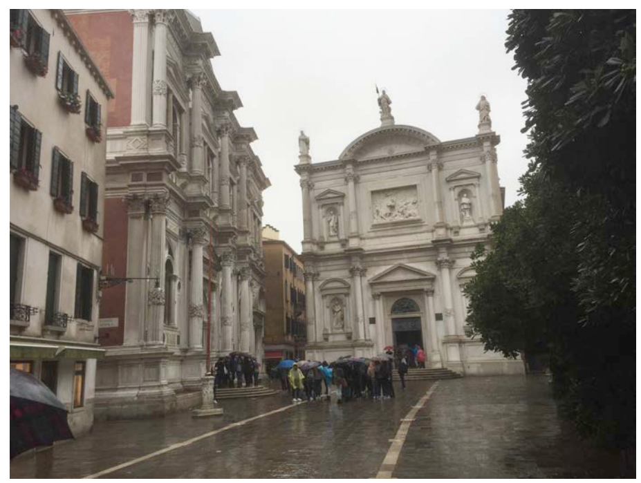
Scuola Grande di San Rocco e Chiesa di San Rocco

Scuola Grande di San Rocco and Chiesa di San Rocco are two sites to visit. A MUST. The Scuola Grande contains countless paintings and other arts of universal value.