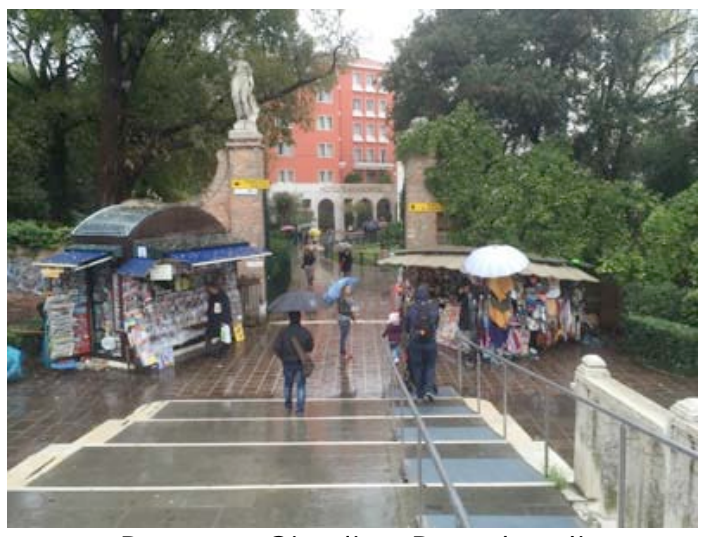
Ponte to Giardino Papadopoli