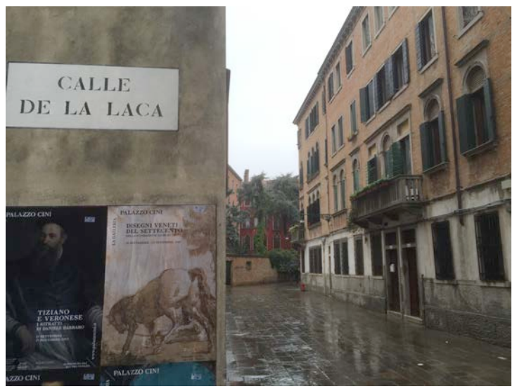
Calle de la Laca, and at its end, turn left along the