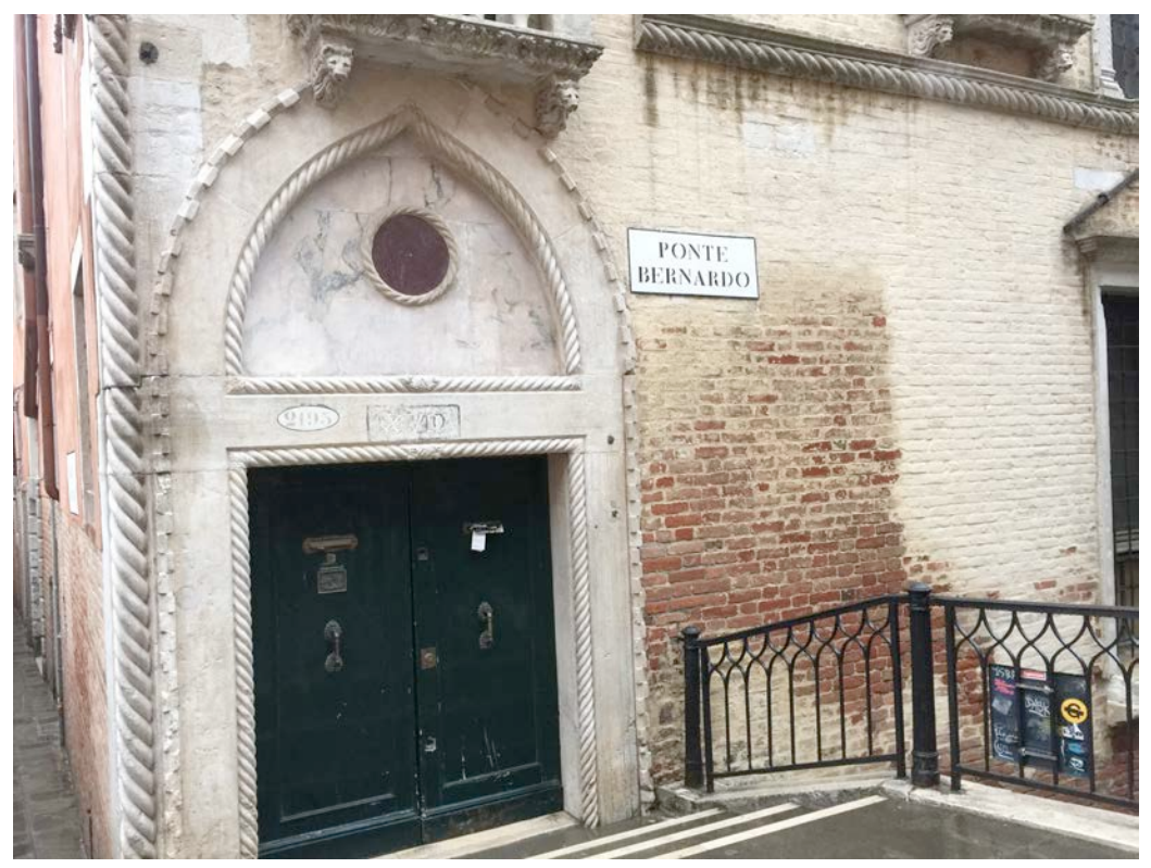
Ponte Bernardo leads to Campo San Polo