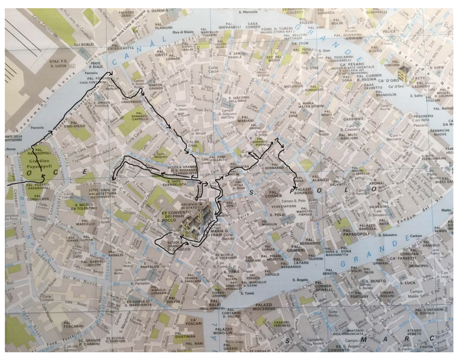
Map 1 to travel 23, Frari, San Polo

At Piazzale Roma, where the little train from Tronchetto arrives, go straight to the bridge that conducts to the garden Papadopoli.